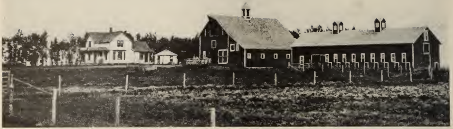
A TYPE OF FARM BEING RAPIDLY DEVELOPED

of this school is highly successful and the institution has a nice enrolment."